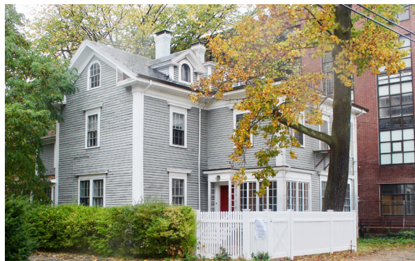
Existing (proposed rendering not available at the time of Whistler publication)