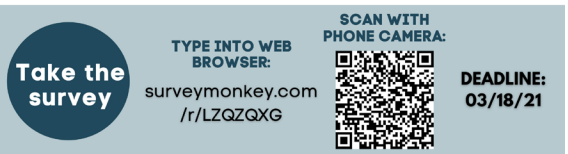
Flyer distributed to neighborhood