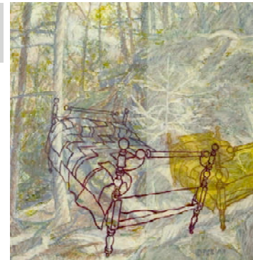
"Double Vision #4" Prilla Smith Brackett