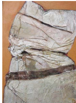
"Paper Dress" Gina Halstead