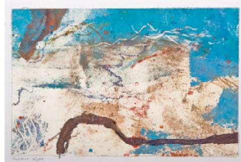
"Untitled" Patricia White

Special appointments are available, call (617) 349-6287 for details.